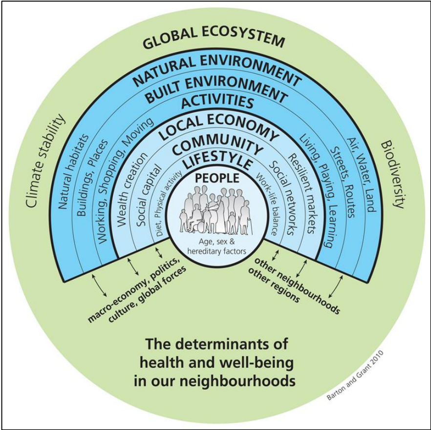
Figure 1: The determinants of health and wellbeing in our neighbourhoods